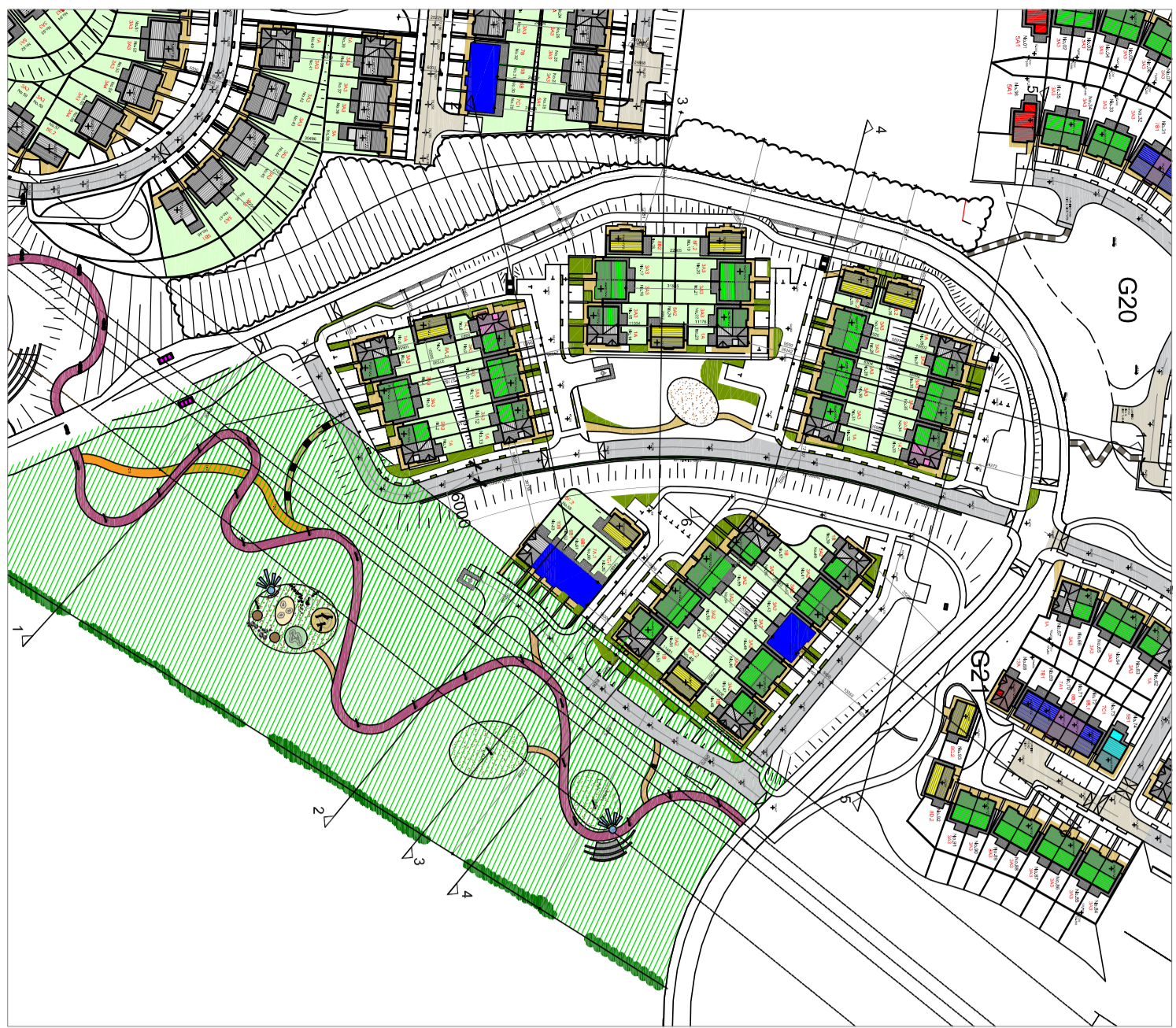
Site Key Plan Final 17.02.18