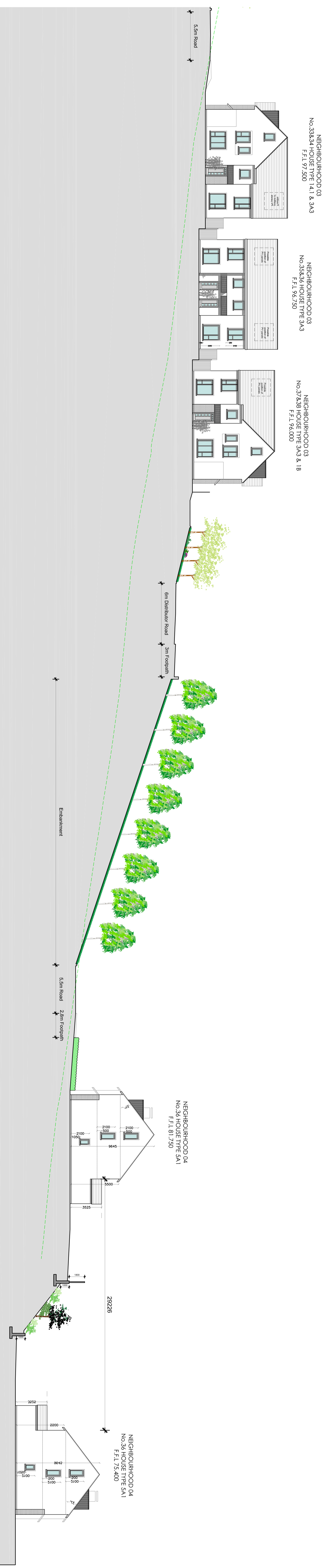
Section S5 Part 2 of 2 Final 17.02.18